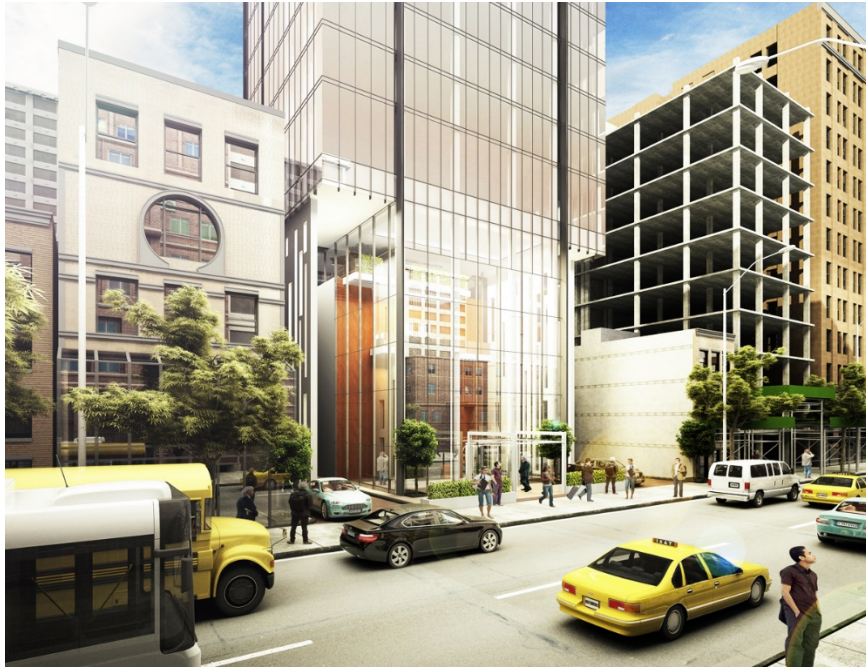
131-141 EAST 47TH STREET.

BY CATHY CUNNINGHAM JUN 6, 2017, 5:55 PM